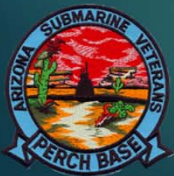
USS SCORPION (SS-278)

USS SCORPION (SS-278) During her wartime career SCORPION sank 18,316 tons of Japanese shipping. After a rendezvous with USS HERRING (SS-233) the afternoon of January 5, 1944, SCORPION was never seen or heard from again. Sometime after January 5th 1944, she was lost in the East China Sea on her 4th War patrol. She was presumed lost to a mine. 77 Men Lost.