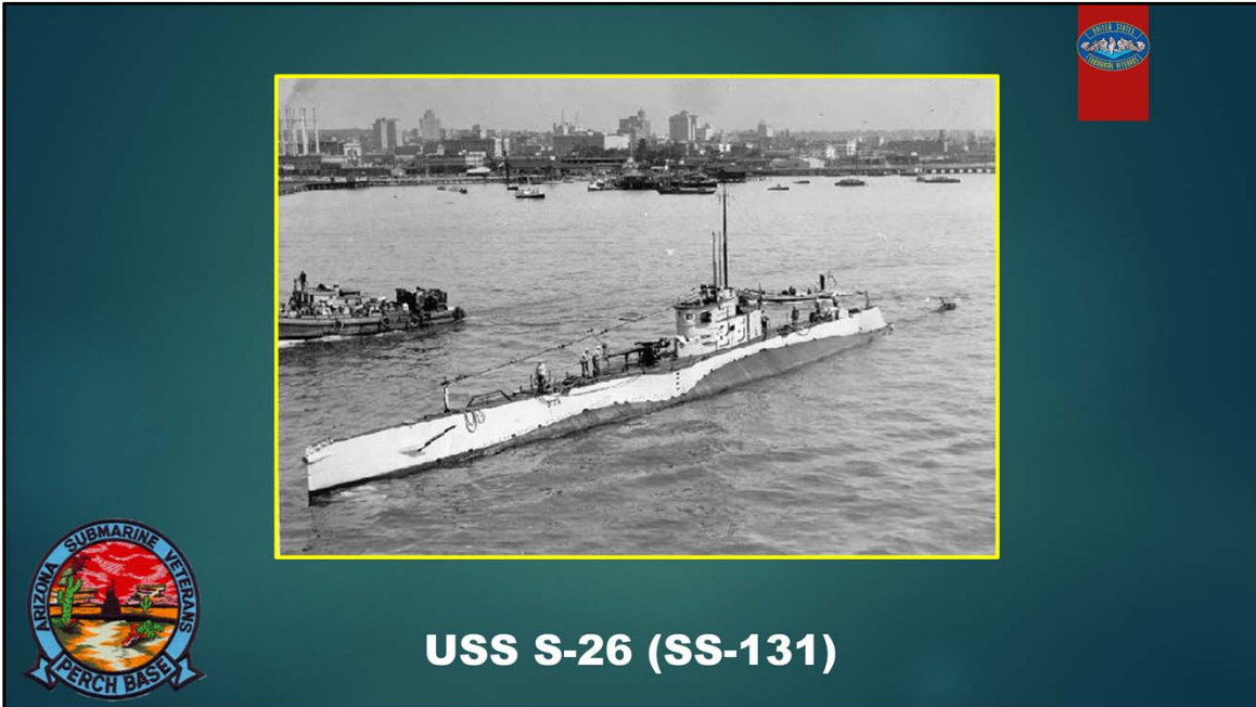
USS S-26 (SS-131)

USS S-26 (SS-131) was lost in the Gulf of Panama on the night of January 24th, 1942, on her second war patrol. 46 officers and enlisted perished. She was rammed by the submarine chaser USS STURDY, PC-460 and sunk within seconds. The CO and XO and one lookout on the bridge were the only survivors. 46 Men Lost. (Bell & slide)